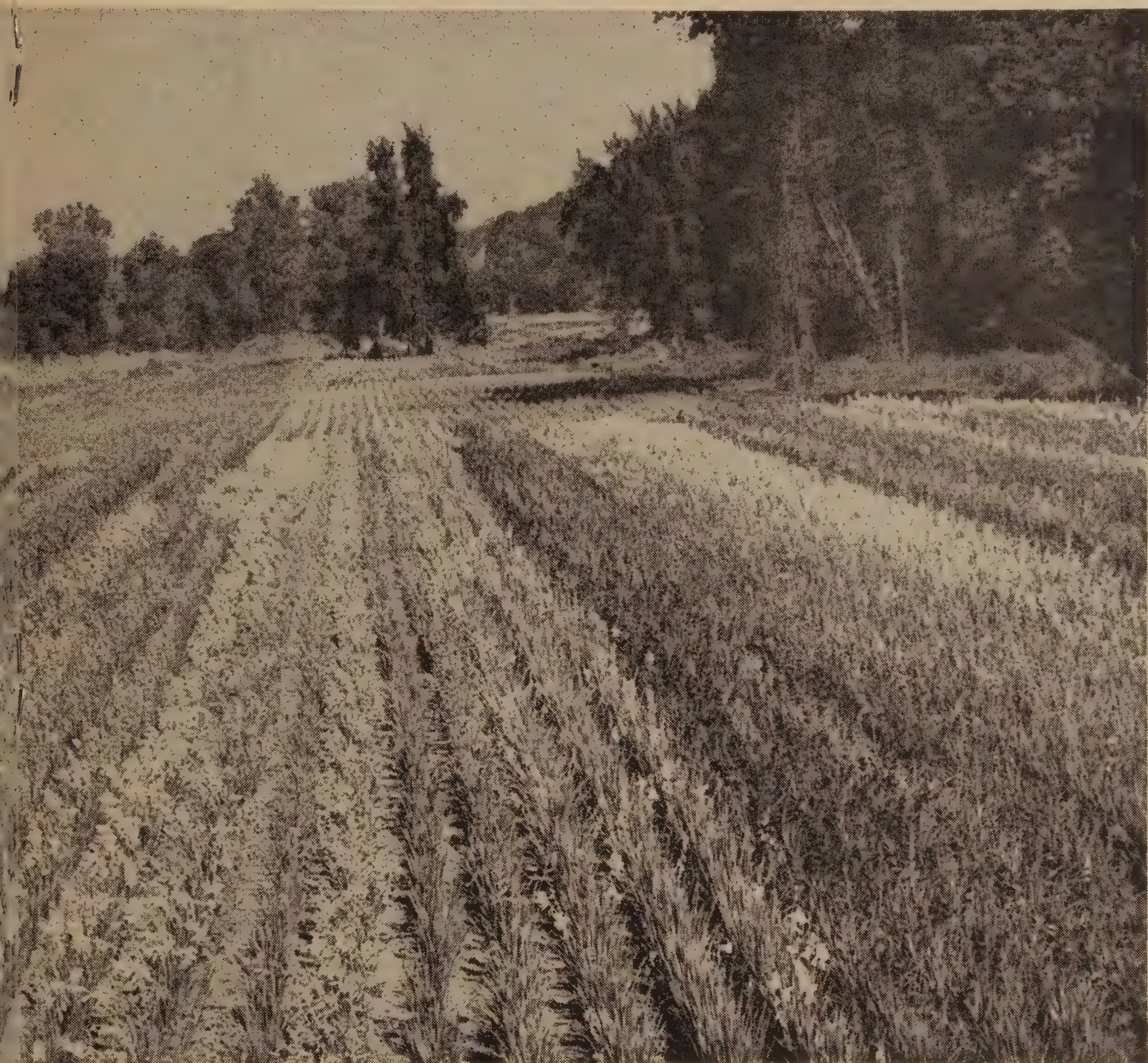
g. In back are the bulblets. They were in solid bloom in August.

GLAMIS 530 (Palmer, '40)— M —Opens 6 wide open salmon rose blooms at one time. Florets are needle-point and as I heard one comment, "easy on the eyes."